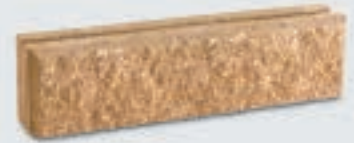
8" No-score Brick 16" x 4" x 2-1/2"D