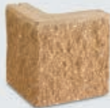
8" Standard Block Corner 8" x 8" x 8"H x 2-1/2"D

Corner blocks are L-shaped and specially designed to ensure perfect 90° corners that create the appearance of a solid concrete/masonry block or brick wall.