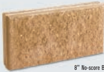
8" No-score Block 16" x 8" x 2-1/2"D

Manufactured with quality, high-density concrete. The ends of each split-face unit contain grooves specifically designed to interlock with either the H-Channel or Moderra Bracket to form a permanent, integrated wall.