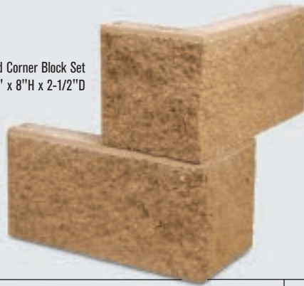
8" Running Bond Corner Block Set 16" x 8" x 8"H x 2-1/2"D