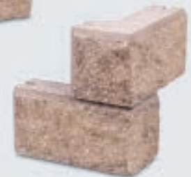
4" Offset Brick Corner Set 8" x 4" x 4"H x 2-1/2"D