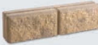
4" Single-score Brick 16" x 4" x 2-1/2"D