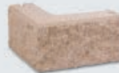
4" Standard Brick Corner 8" x 8" x 4"H x 2-1/2"D