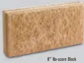
8" No-score Block